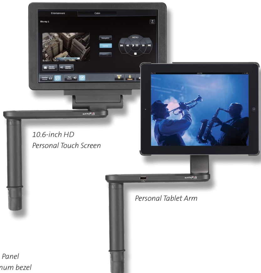
10.6-inch HD Personal Touch Screen

This convenient, subscription-based service includes add-on options such as special access to the latest Hollywood movies.