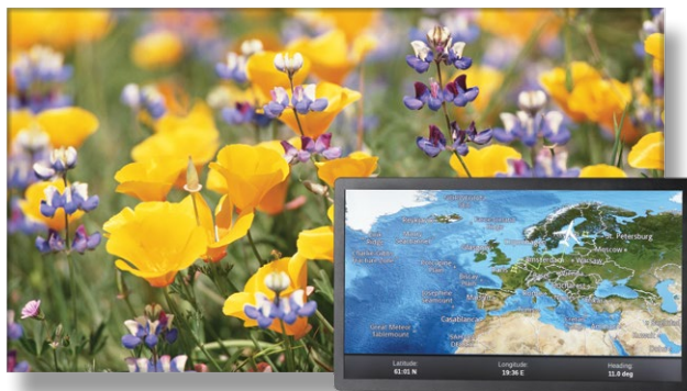
42-inch bulkhead display