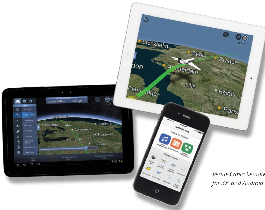
Venue Cabin Remote App for iOS and Android devices

Venue accommodates in-flight entertainment systems in cabin areas with high-density seating. Your staff or others who spend time there during flights will find a relaxing environment with a large selection of content for their enjoyment.